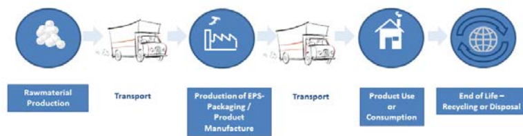
Table: Lifecycle of EPS packaging material

A presentation of quantified environmental life cycle product information for expanded polystyrene (EPS) packaging systems.